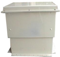
Pipe Chase Housing